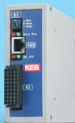
KEB C6 Controller & HMI