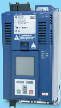
KEB F6 Servo Drive