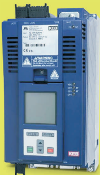
KEB F6 Servo Drive