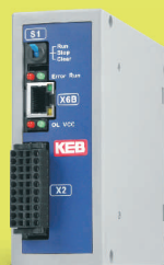
KEB C6 Controller & HMI