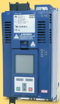
KEB F6 Servo Drive