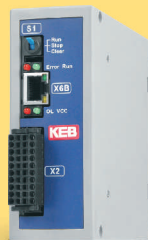
KEB C6 Controller & HMI