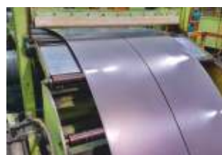
Slitter for Steel