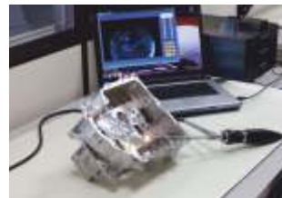
Motor Test Bench