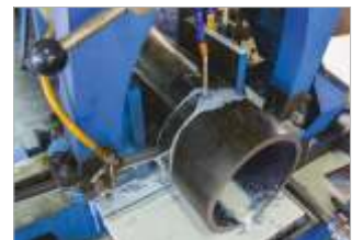
Pipe Cutting Machine