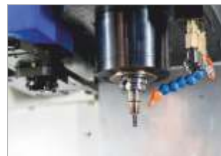
High Speed Spindle