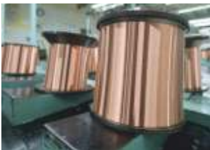
High speed block-type wire drawing machine