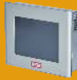
Visualisation & HMI