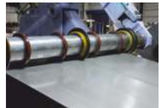
Continuous shear control for CTL in rolling mill