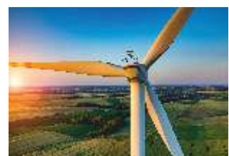
Pitch & Yaw Control for Wind Turbine