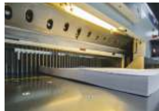
High speed CTL for corrugated board and paper cutting machine